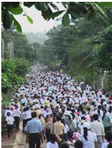
Running for solidarity : tens of thousands have joined