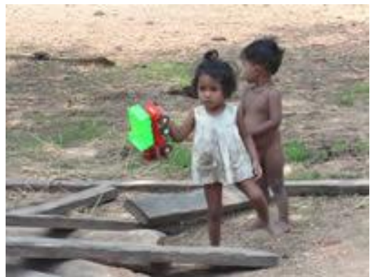
Children in a village in Svay Riêng, Cambodia