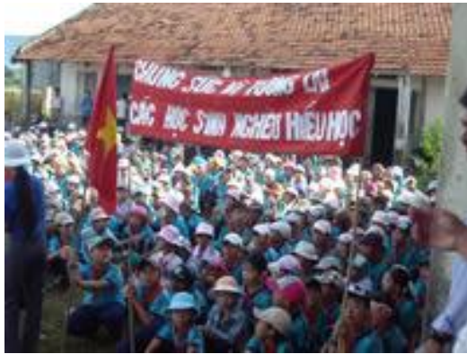
The banner: Together for the future, all children to school!

important to measure impact, not only in financial terms but in terms of yields etc.