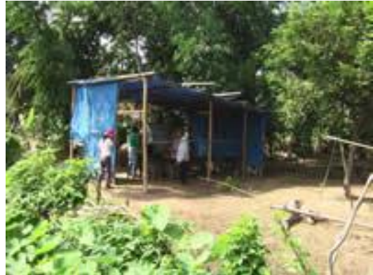
Disability is often the cause of acute poverty

The next step will be to invite out of school children to join. Over 150 households have been visited; the villagers and neighbors quickly provide help to go and see the families forgotten in the official lists and statistics.